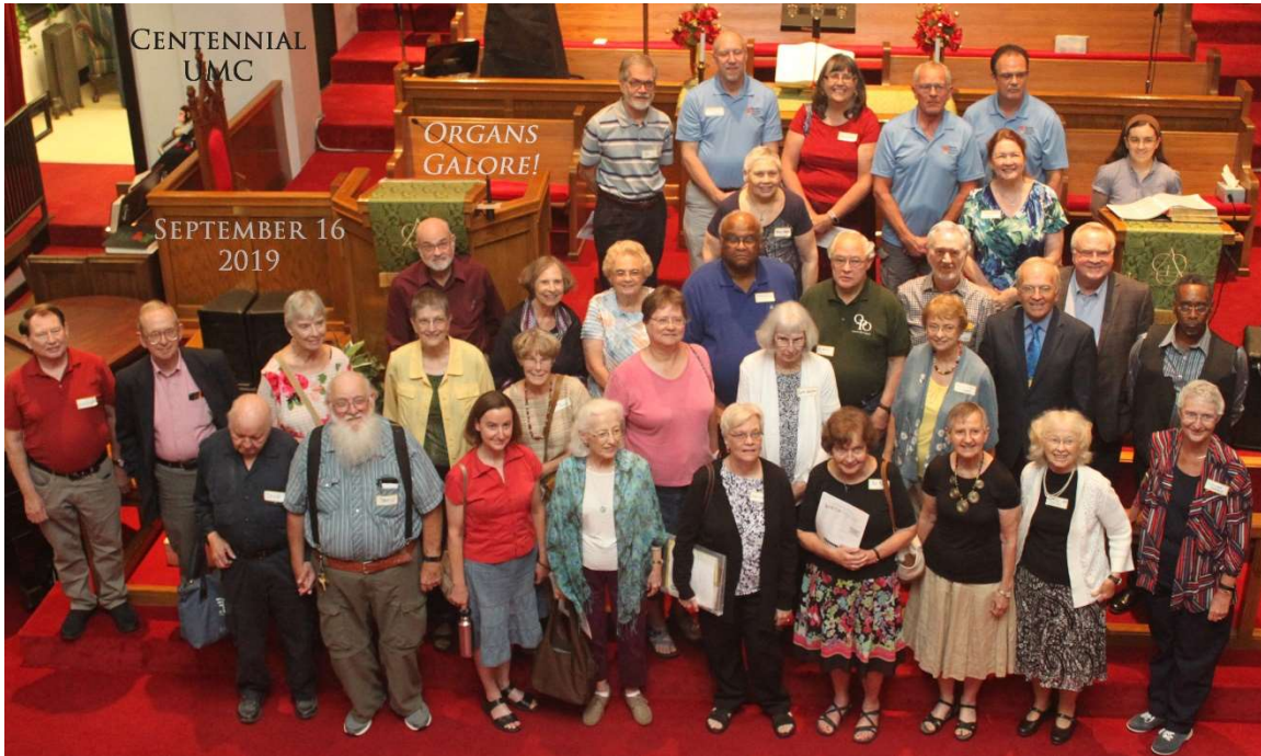
A family style photo of our members from September 16, 2019.